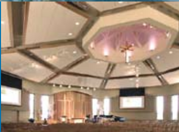
The Soul Factory, Bakersfield, CA